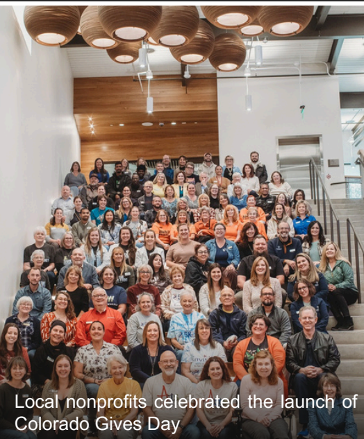
Local nonprofits celebrated the launch of Colorado Gives Day