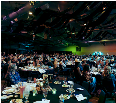
RED CARPET RODEO ANNUAL GALA Friday, April 17