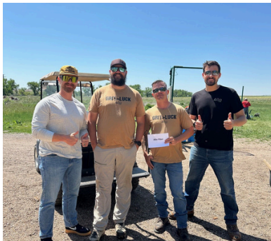
PULL FOR YOUTH CLAY SHOOT Saturday, June 13