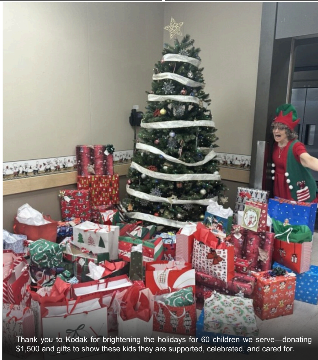
Thank you to Kodak for brightening the holidays for 60 children we serve—donating $1,500 and gifts to show these kids they are supported, celebrated, and cared for.