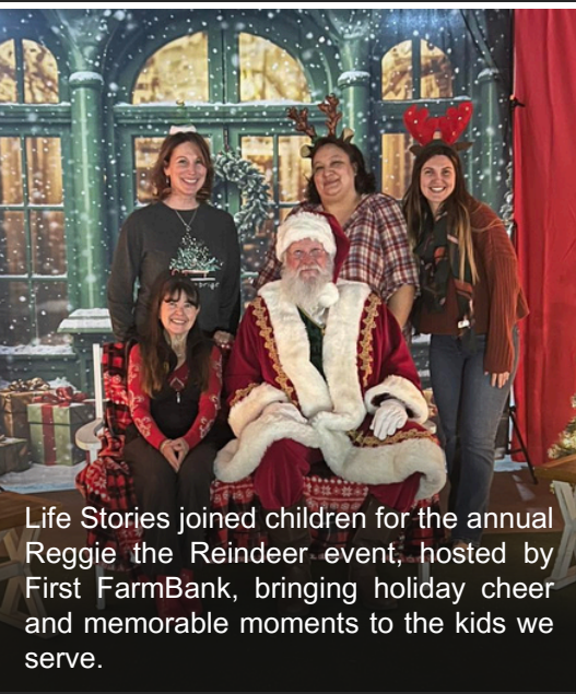
Life Stories joined children for the annual Reggie the Reindeer event, hosted by First FarmBank, bringing holiday cheer and memorable moments to the kids we serve.