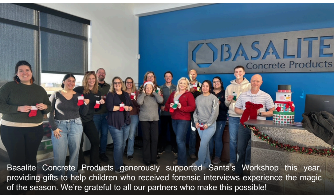
Basalite Concrete Products generously supported Santa's Workshop this year, providing gifts to help children who received forensic interviews experience the magic of the season. We're grateful to all our partners who make this possible!