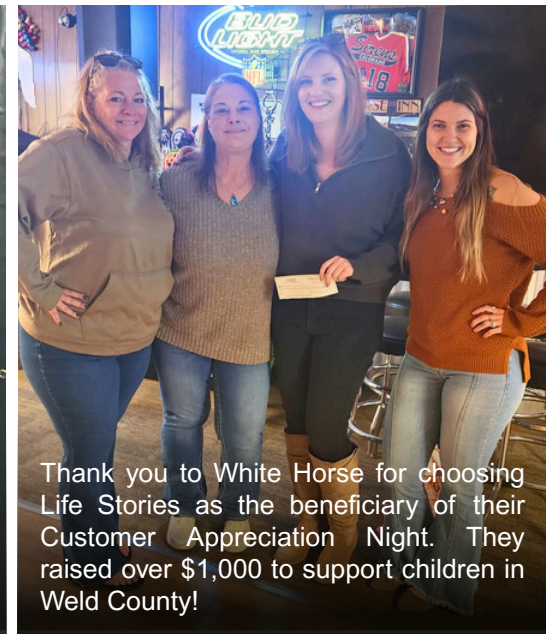
Thank you to White Horse for choosing Life Stories as the beneficiary of their Customer Appreciation Night. They raised over $1,000 to support children in Weld County!