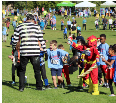
SUPERHERO RUN Saturday, Sept 19

TOGETHER, WE GAVE 1,069 CHILDREN AND FAMILY MEMBERS